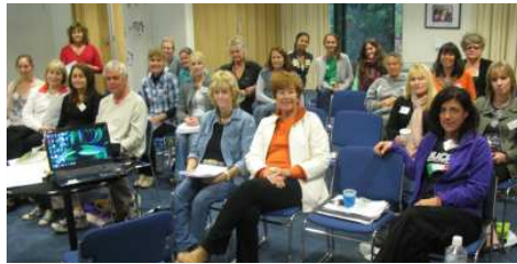
Clare College Class