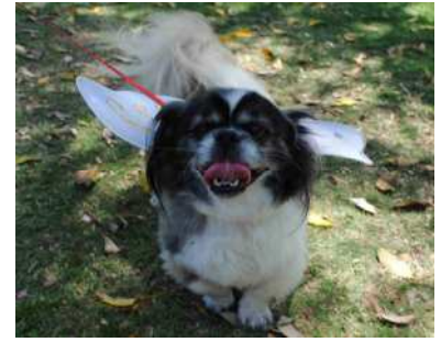
Yin Yang promoting Angel Day