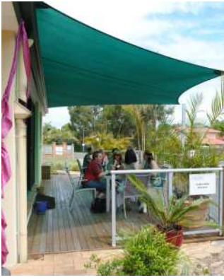
New shade sail for the Café