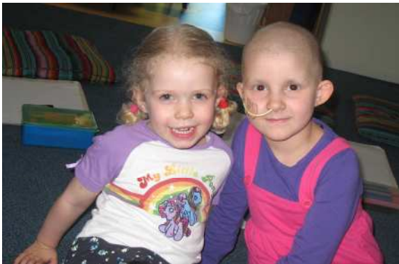
The Holiday House supports the entire family

Paradise Kids receives no Government Funding. We get many referrals from the Government itself and we fill a huge gap of need in the health system. We are fortunate that the Hospice is granted some funding and, like a nurturing mother also helps Paradise Kids survive. Hopewell Hospice , one of only three community hospices in Queensland, provides palliative care in a lovely home-style setting to 8 residents and an essential part of palliative care is the outreach bereavement service offered by Paradise Kids.