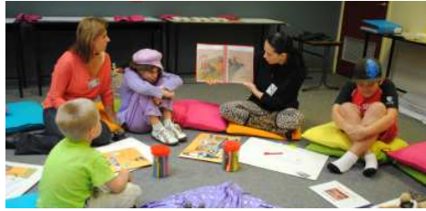
PK Mobile Response Team in Gatton