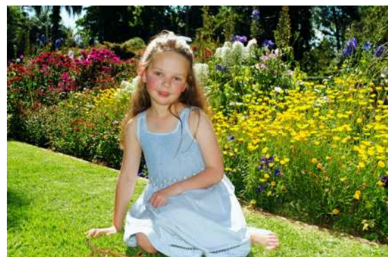
The vibrant colours of a child's summer

We are grateful to our wonderful group of 106 trained