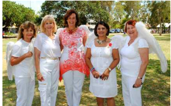
The (Angelic) Hopewell Board

In an ever-changing world, however, we are challenged to keep growing and adapting to changing circumstances. Natural disasters, combined with global financial crises have made it more difficult for charities to raise the funds that are essential for providing services to clients, yet again we have survived and thrived throughout our Divisions.