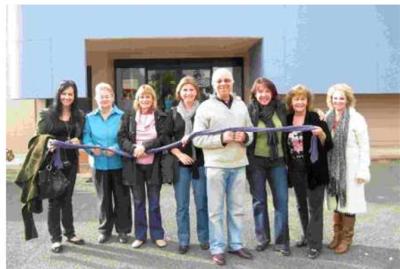
The PK Outreach Team in Gatton

Queensland has had more than its fair share of storms this year. In July the Paradise Kids Mobile Response Team was formed, and we took a team of volunteer 'buddies' and staff to the previously flooded Lockyer Valley. Our PK program is transportable, adaptable and available in times of crisis as our gift of service to the world. All buddies generously paid for their own transport, meals and accommodation as a gift to the flood stricken communities. A big-hearted sponsor paid for all staff accommodation, the program costs itself and the Suicide Intervention Skills Training that was offered to the same community.